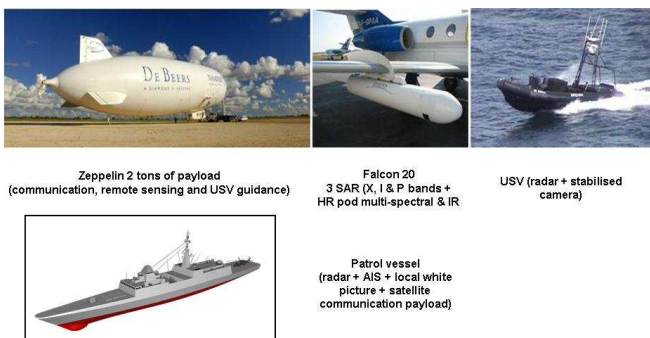
Figure 3. Mobile platforms

In addition, the optimal best sensor data combination is also studied and defined to track different types of vessel in various meteorological conditions (night, day, sea states, raining, cloudy, etc.).