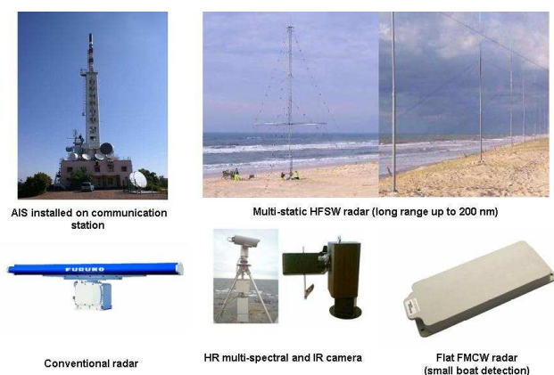
Figure 2.I2C shore sensors

The shore based platforms integrate most of existing and advanced sensors for sea surveillance. Sensors are: 3 types of radar (conventional pulse, HFSWR and FMCWR), multi-spectral camera (IR and visible domain) and AIS stations network.